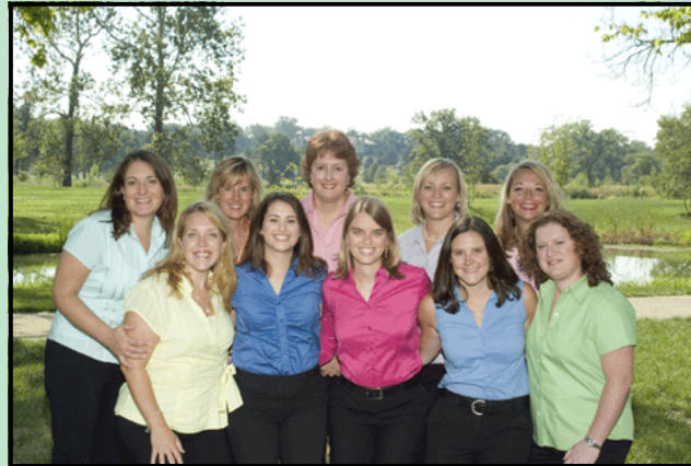
The Destination St. Louis Team

Well received, this tour is a perfect choice for your group outing as the Halloween season approaches. Contact Destination St. Louis at (314) 727-2400 to arrange a "spooktacular" outing for your group.