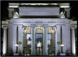
Missouri History Museum

To arrange a group outing or tour or for assistance in planning an event at the Museum, contact Destination St. Louis at (314) 724-2400.